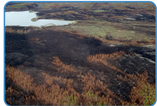
Figure 1: 2014 Burn Scar within caribou habitat

During the summers of 2015-2018, we established over 650 study plots in the NWT Taiga Plains and Taiga Shield ecozones, some in areas that burned in 2014 and some in older forest stands that burned from 19 to 232 years ago (Figure 2). We measured how these plots burned and what types of trees or other plants grew back following a fire.