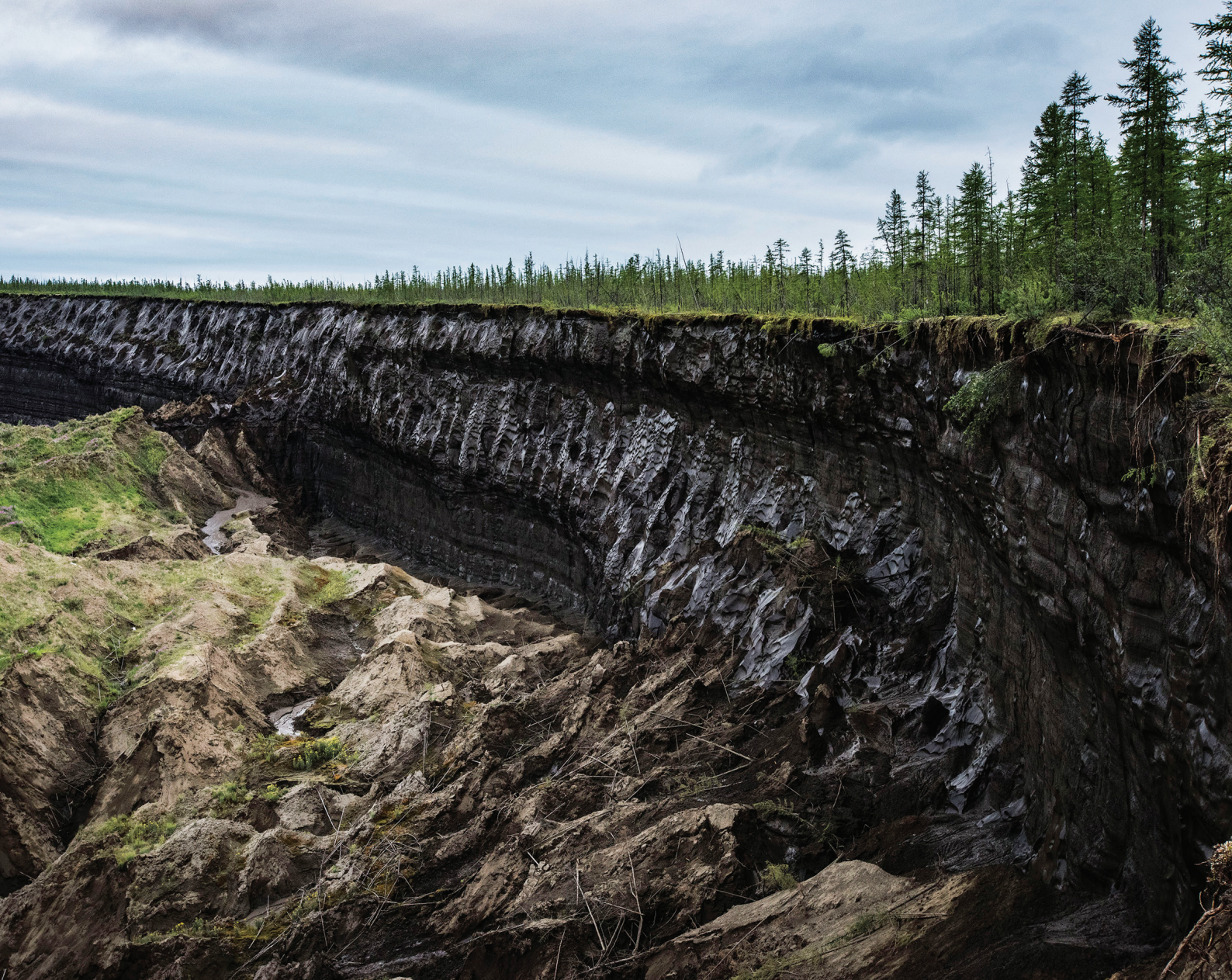
The Batagaika crater in eastern Russia was formed when land began to sink in the 1960s owing to thawing permafrost.